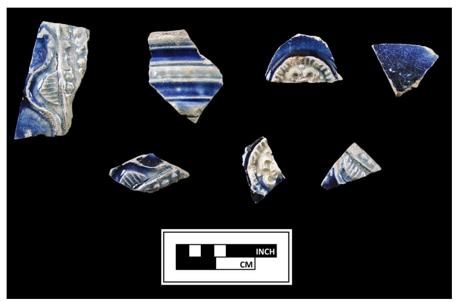
Figure 1: Rhenish blue and gray stoneware fragments recovered from the Clifton Site from Julia A. King's presentation to HPC, "In Search of Thomas Gerard"