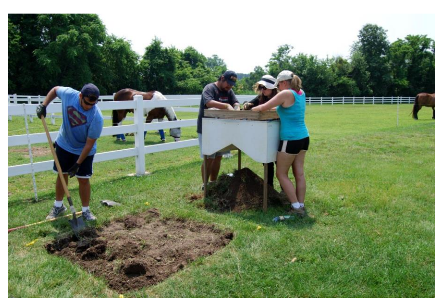
Figure 2: Excavating Unit 495400 at the Clifton Site from Julia A. King's presentation to HPC, "In Search of Thomas Gerard"